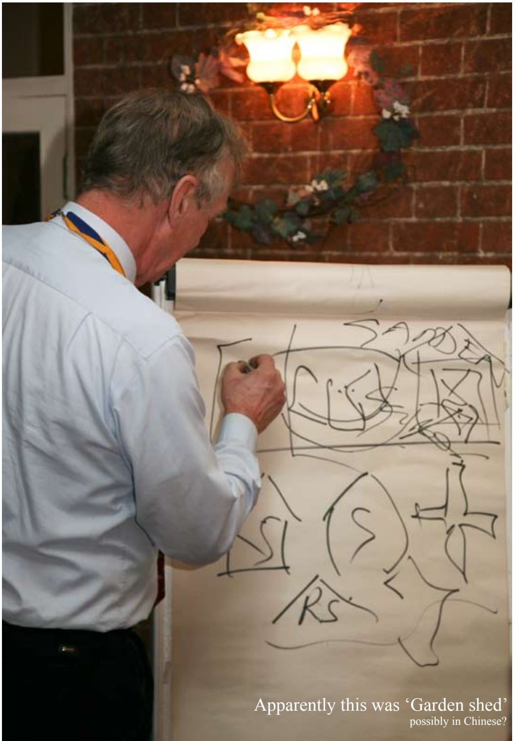
Apparently this was 'Garden shed' possibly in Chinese?