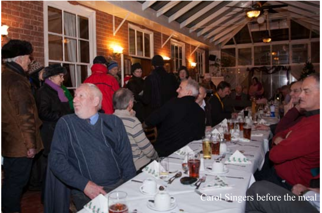
Carol Singers before the meal