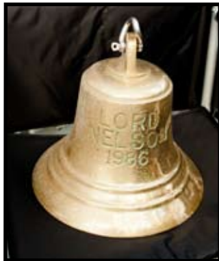
A really big clanger!!!