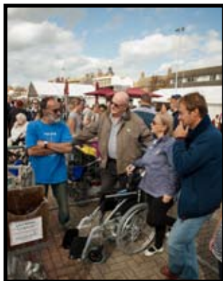
A nervous team awaiting permission to embark - the public had to be cleared before they were allowed on.