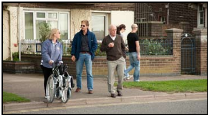
Our intrepid team manouevering chair and traffic